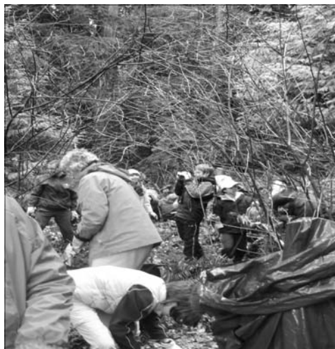
Students, staff and parents from Mulgrave School helped to remove the non-native, invasive plant, lamium, Lamium galeobdolon , from Lighthouse Park.