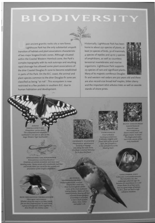
Lighthouse Park Preservation Society Display